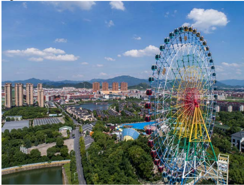
Fig.1 The Light of Ecological Civilization Shines on Beautiful China

utilization of natural resources, large-scale pollution and destruction of ecological environment, and a series of ecological problems such as climate change, land degradation and sharp decline of biodiversity have seriously affected the survival and development of contemporary and future generations, and triggered profound reflection of human beings [7]. The attention to ecological issues abroad has begun since the twentieth century, and has gradually deepened from the technical level of attention to ecological protection and environmental pollution prevention to the generation of ecological problems. A group of philosophers, sociologists, and other scholars have written books on the analysis of the crisis in order to expose and criticize the capitalist system as the root cause of the ecological crisis, and the research on ecological problems has gradually deepened [8]. Since the 20th century, China has paid more and more attention to the ecological problems. In the 21st century, the call for the construction of socialist ecological civilization has become the general trend. Domestic theorists have made great efforts in the study of ecological civilization and made remarkable progress.